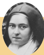
St Thérèse of Lisieux

God would never inspire me with desires which cannot be realized; so in spite of my littleness, I can hope to be a saint.